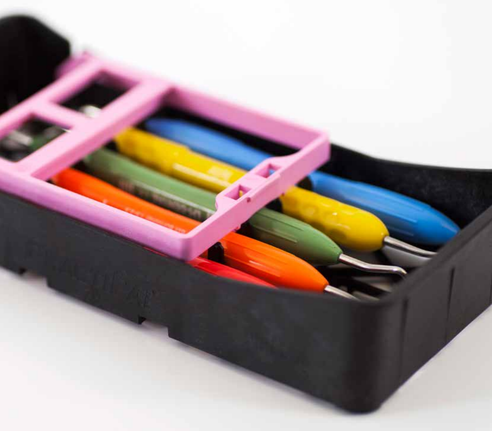
PractiPal® Mini Tray