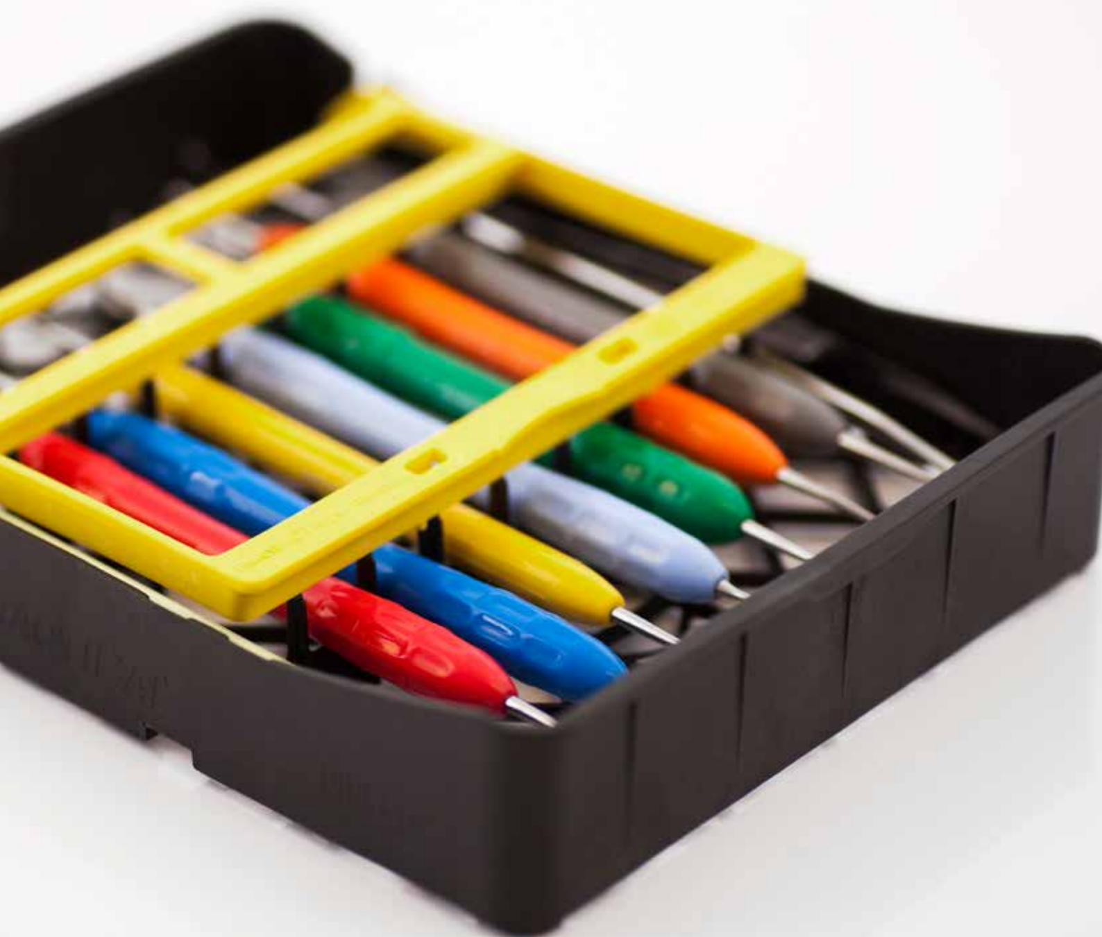
PractiPal® Half Tray