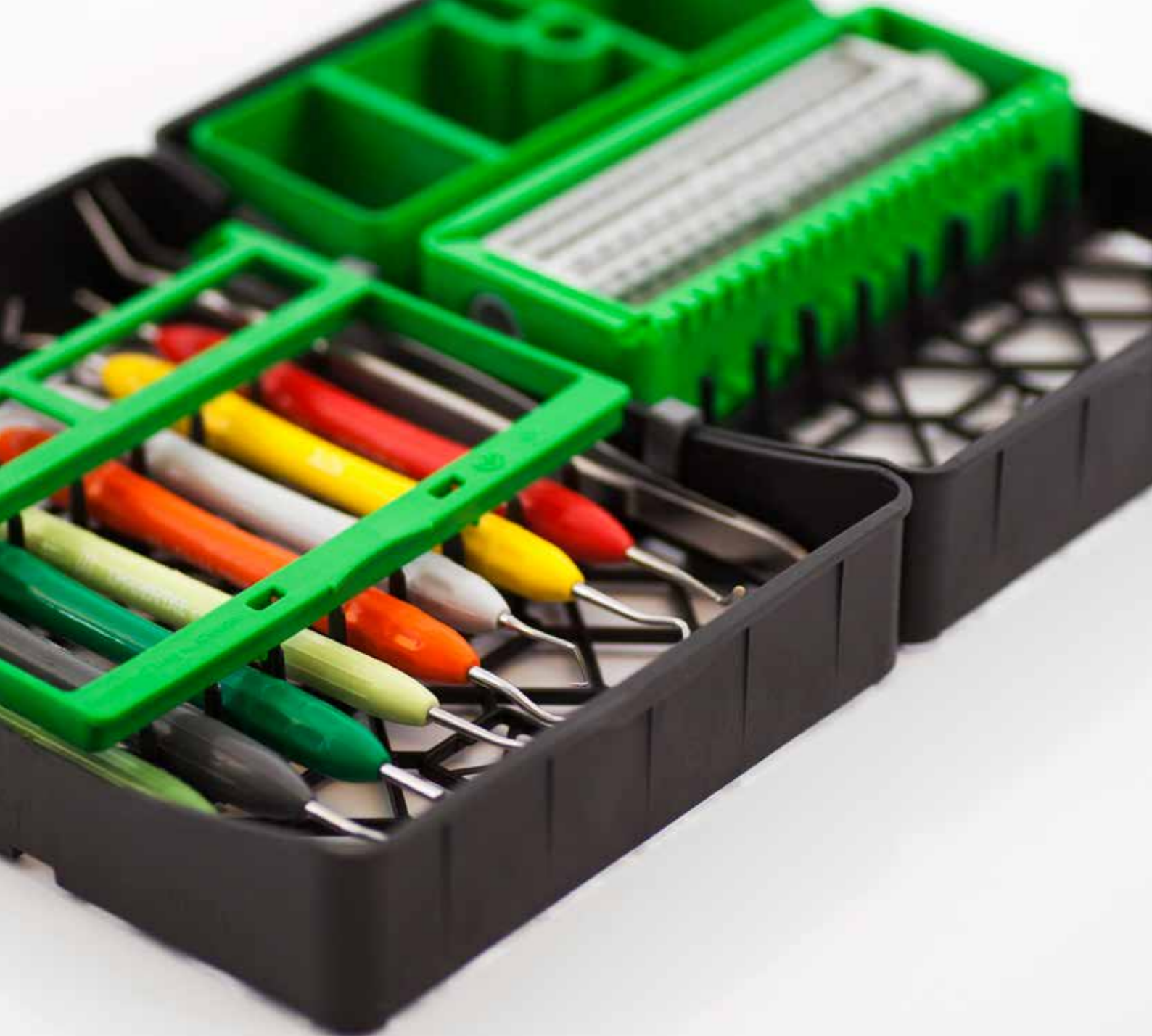
PractiPal® Full Tray